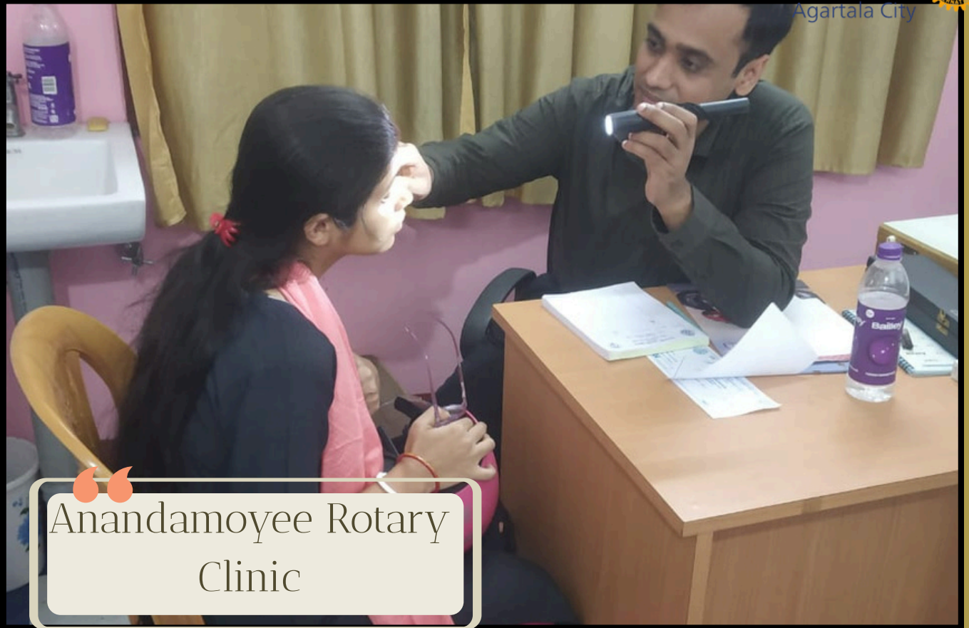
Anandamoyee Rotary Clinic